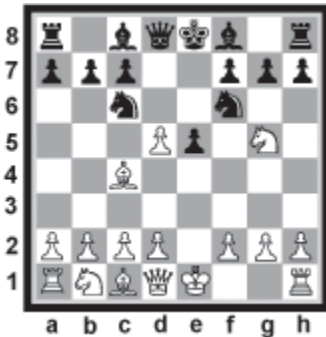
Chess Openings: Two Knights Defense