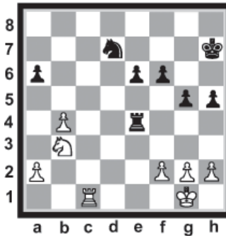
Chess Tactics: White to Set a Pin